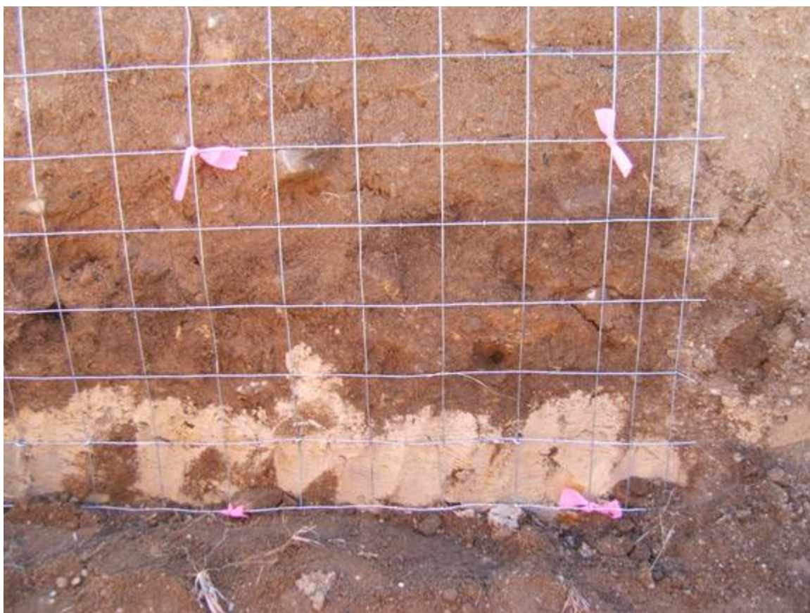
Figure 3. Tonguing of tailing in the basal contact zone of a soil cover overlying tailing. Wire mesh grid spacing is 10 cm.

The chemical data collected from these profiles do not provide conclusive evidence that upward migration is the causative factor for acidification in the basal contact zone. Incorporation of tailing probably explains at least part of the observed decrease in pH. The chemical data are discussed below with respect to the potential for upward migration. Sulfate is more conservative with respect to mobility than Fe or Al, which are strongly affected by adsorption reactions and secondary mineral formation. Sulfate solubility is likely to be controlled primarily by gypsum where free Ca occurs in solution. The regular increase in \text{SO}_4^{-2} concentrations with depth in the cover soils suggests downward translocation (leaching) of \text{SO}_4^{-2} from the surface layers. Diffusion from the underlying tailing, or \text{SO}_4^{-2} generated through oxidation of tailing mixed in the basal cover during construction are other possible causes. It is not possible to distinguish the relative contributions of these processes with respect the \text{SO}_4^{-2} distribution. Thus, the \text{SO}_4^{-2} distribution is inconclusive with respect to demonstrating upward migration as an active process in these cover-waste systems.