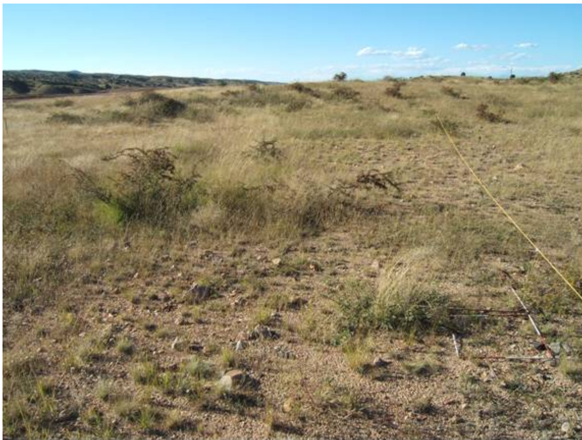
Figure 1. Vegetation condition on the reclaimed tailing repository in October, 2004.

The study site comprises a 60 ha (150 acre) tailing repository covered and revegetated in 1981 (Fig. 1). The project area sits along the Continental Divide in southwestern New Mexico at an elevation of about 1,900 m above mean sea level. The climate is warm and dry with a mean annual precipitation of 410 mm and mean annual temperature near 10°C. Precipitation falls mainly in short, intense, thunderstorms between July and October; lower intensity rain storms and snow occur from November to March. Native soils are loamy-skeletal, clayey-skeletal, and fine families of Aridic Haplustalfs formed in residuum from late Tertiary and Quaternary conglomerates (Gila Conglomerate Formation). The surrounding vegetation is characteristic of the transition zone between desert grassland and the mixed evergreen woodland. In 2004, vegetation cover on the repository averaged 38 percent and was dominated by warm season grasses, forbs, and shrubs (Romig et al., 2006).