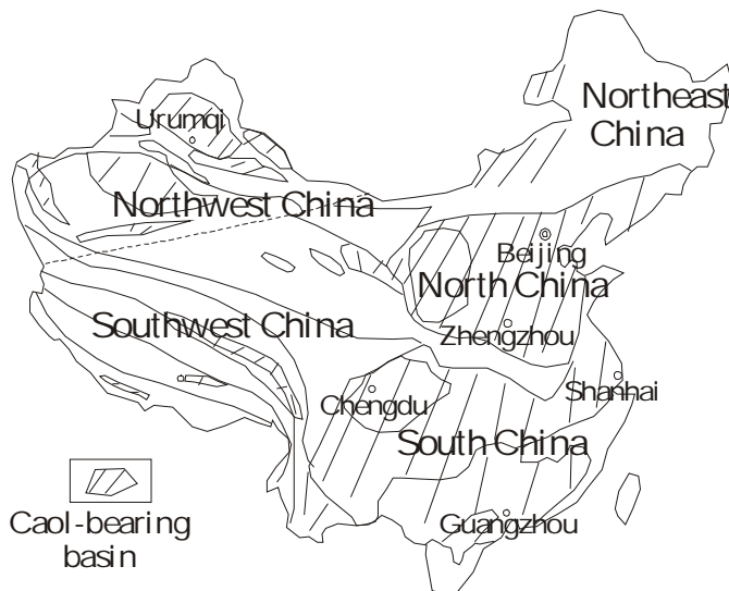
Figure 1 Distribution of Coalfields in China

There are mainly five types of coalfields in China, i.e. Permian-carboniferous Coalfields in North China, late Permian Coalfields in South China, early Jurassic Coalfields in Northwest China, Cretaceous Coalfields in Northeast China, Tertiary Coalfields in South China, etc. The distribution of the coal-bearing basins is shown in Figure 1 (China Bureau of Coal Geology 2001). Different types of coal-bearing basins means different typical hydrogeologic conditions and different typical mine water issues. This article mainly focuses on the tough mine water issues in North China, South China and Northwest Coalfields.