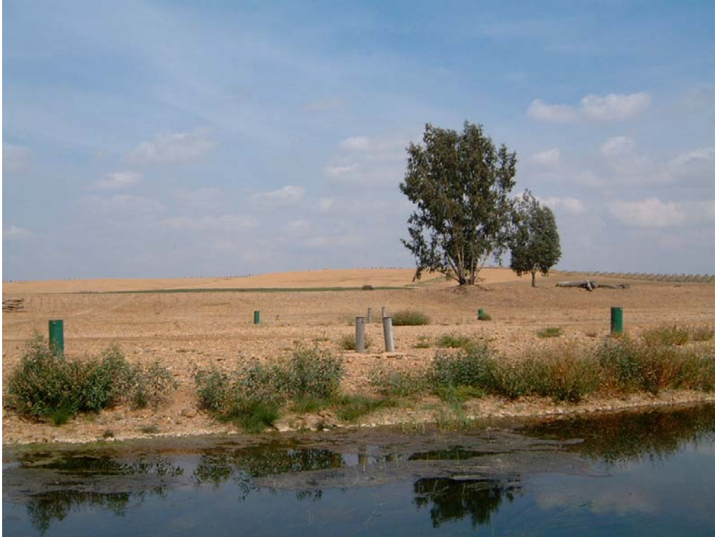
Figure 2. The Aznalcóllar Permeable Reactive Barrier (PRB), Spain, used as a major field study facility of PIRAMID. View looking east across the Río Agrio, along the long axis of the PRB. (Groundwater flows from left to right). The paired pipes in the centre of the picture are the casings of monitoring wells which access the interior of the barrier, and the other pipes visible at the left and right extremes of the field of view are up-gradient and down-gradient monitoring wells respectively.