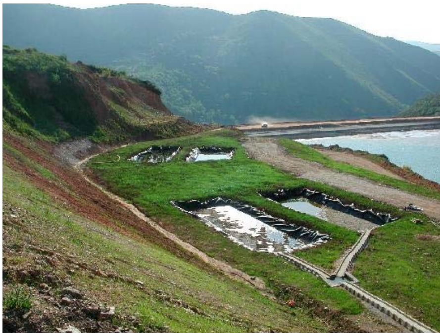
Figure 3. The pilot system for passive destruction of cyanide at Río Narcea Gold Mines' El Valle Mine, Belmonte (Asturias, northern Spain), showing aeration cascade leading towards two parallel treatment streams, each comprising a compost wetland cell followed by an aerobic cell.