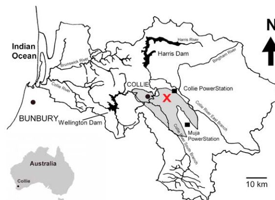
Figure 1 Location of study area (shaded area indicates coal mining basin)

End uses investigated for Collie pit lakes have included trials of aquaculture, saline water storage (saline flows in the Collie River are diverted to a pit lake, reducing salt loads to Wellington Dam downstream), use of water for Power Station cooling, and water skiing.