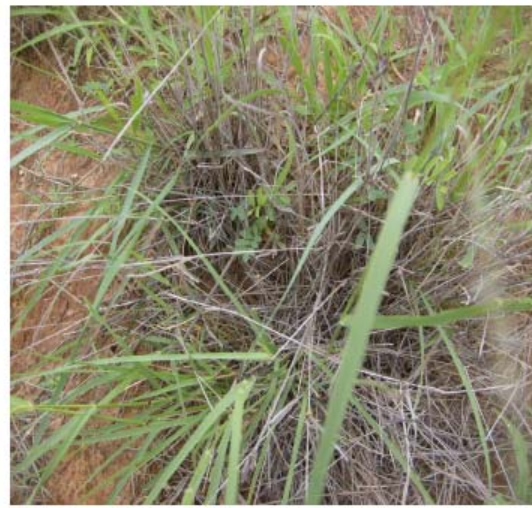
Hyparrhenia hirta Figure 1. Some of the grass species that were found growing at New Union Gold Mine

The total heavy metal uptake of different grass species are indicated in Table 3. The results showed the grass species Cynodon dactylon accumulated the most of heavy metals and was widely distributed at the both tailings dams. C. dactylon absorbed more of the following heavy metals (mean total from tailings A & B): 232.5 mg/kg for Mn; 39.8 mg/kg for Zn; 48.5mg/kg for Cu; 5.7mg/kg for Pb; 1.0mg/kg for Cd and 1.9mg/kg for Co. The Cyperus esculentus was ranked second in the heavy metal accumulation and its distribution was restricted to tailings dam A. The third position was the Hyparrhenia species of which H. tamba colonised tailings dam A and H. hirta colonised tailings dam B. On heavy metal accumulation the results showed that H. tamba species was accumulated more than the H. hirta species and the reasons for this distribution and different metal uptake are unknown at this stage. The Paspalum dilatum species accumulated the least heavy metals (mean total of 290.7 mg/kg) in comparison to other grass species. This may be attributed to factors such heavy metal toxicity since other grass species were able to grow under the adverse pH conditions of 3.41 to 3.58.