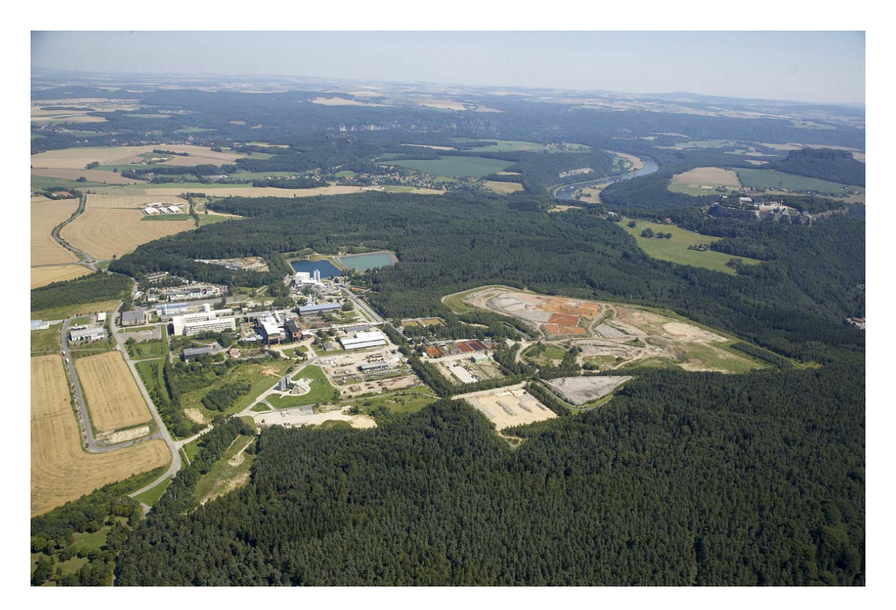
Figure 2. Aerial view of the surface installations of the Königstein uranium mine, administrative buildings, mine shafts and water treatment plant to the left-hand side, on the right the partly covered mine dump with the Elbe River and the Königstein fortress in the rear

The uranium was extracted from the 4th sandstone aquifer, the deepest of four hydraulically isolated aquifers in a Cretaceous basin, initially using conventional mining methods, but later an underground block leaching method using sulfuric acid (2 to 3 g/l H_2SO_4 ) was implemented. It was especially due to the reactions of the oxidizing sulfuric acid that the geochemical nature of the deposit was substantially changed, with a high level of pollution remaining within the deposit, mainly sulfate, heavy metals and naturally occurring radionuclides.