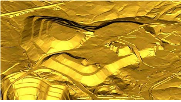
Figure 3. Mine Residue Deposit as Designed – Without Erosion