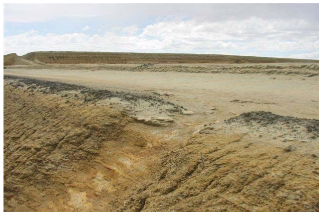
Figure 1. Gully Formation on a Terrace of a Disused Tailings Dam

Engineered structures to remove water from the terraces using an approach of engineered chutes or penstocks has also in the authors opinion, proved unsuccessful in most cases, often resulting in complete wash aways of concrete chutes or erosion and flow below the chutes.