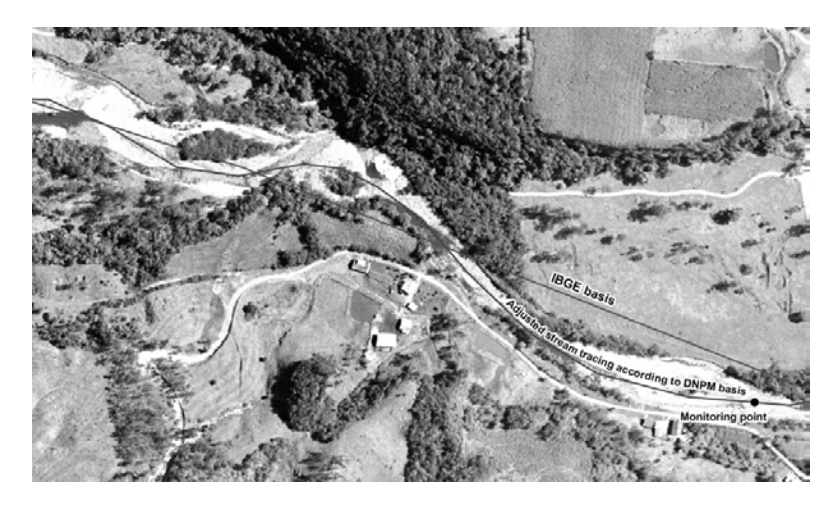
Figure 2 Stream tracing correction

duction orthophotos (DNPM 2002). Besides the good quality of those bases, some correction had to be done in order to adjust the water resource features, especially the streams tracing (fig. 2).