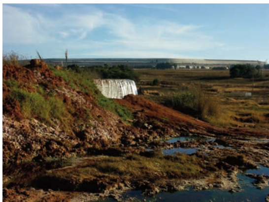
Fig. 2 Acid mine drainage discharging from an abandoned mine shaft in the West Rand Gold Field.

and pollution of water. However historical legislation which governed mining was not as comprehensive, particularly with respect to environmental management and closure (Coetzee et al. 2008; van Tonder et al. 2008).