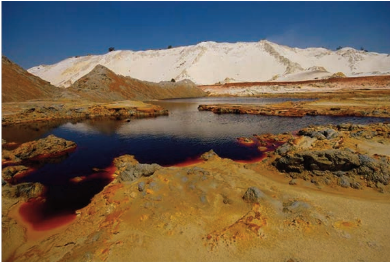
Fig. 3 Acid mine drainage generated in surface tailings deposits in the West Rand

adopted by government combined the objectives of maintaining a safe water level by re-establishing the pumping of water from the underground workings and the reduction of volumes to be pumped via the control of surface water ingress. It was recommended that the pumped water be treated. Initially this would be by neutralisation, but it was recommended that desalination be investigated as a medium- to long-term measure. The importance of AMD sources over and above the underground mine voids, in particular diffuse sources such as surface mine residues (Steffen Robertson and Kirsten 1986; Fig. 3) was acknowledged, as was the long-term nature of the problem faced. A key gap identified is the long term funding of the process as many of the mines involved closed in the past when the legislative requirements for mine closure were not as strict as they are today. The need for enhanced water quality and flow monitoring was also recommended.