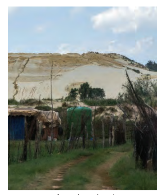
Figure 4 Grootvlei Snake Park settlement, Soweto

All the polluted water flows into river systems used for drinking water. If contaminated soils and sediments are removed and the