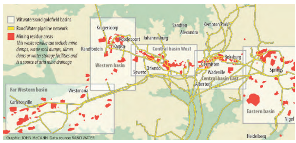
Figure 1 Rand water pipeline and proximity to mine waste dumps on the Witwatersrand.