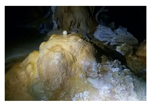
Figure 2 General view of sinter formations in the Neutrino