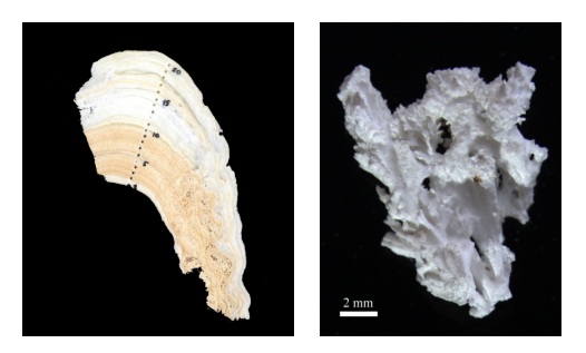
Figure 4 Sampling sites for the C and O isotopic composition from stalagmite (a) and corallite stalactite (b) samples

travertines formed from the hot springs of Pamukkale (Turkey) and travertines from cold carbonic waters of the Tokhan-Upper source (Elbrus)