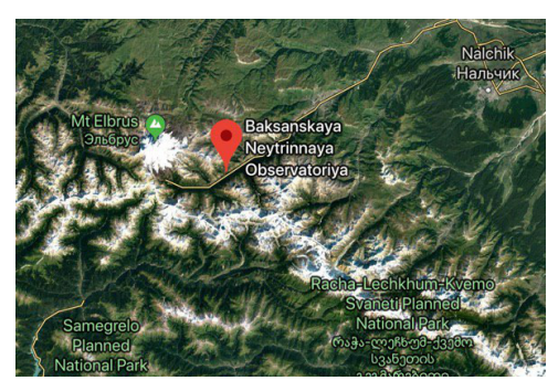
Figure 1 Location of the Baksan Neutrino Observatory (Google Earth)

The chemical composition of water. The water for analysis was taken in the adit from the unloading zone confined to cracks from 3 to 6 m long at a distance of 3800 m from the entrance. 2 hours after water sampling an abundant white crystalline carbonate precipitate fell from it. Chemical analysis of water was made at the State University of the Ural Branch of the Russian Academy of Sciences (analyst N.V. Bykova). The