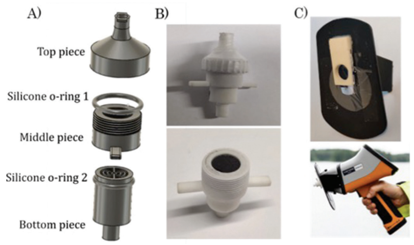
Figure 2 Filter holder used in the study. A) An exploded view of the design of the 3D printed parts with two additional silicone O-rings. B) Photographs of the holder. The top photograph shows the holder with all parts assembled and the bottom photograph shows the holder with top piece removed showing the surface of the filter, from which metal signals are measured with pXRF. C) Adapter used to attach the filter and holder to pXRF measurement position.

The 3D printed filter holders were designed to protect the filter from mechanical wear and chemical contamination. It allows also easy transfer and attachment of the filter to measurement position of pXRF with the designed adapter. The XRF emission peaks