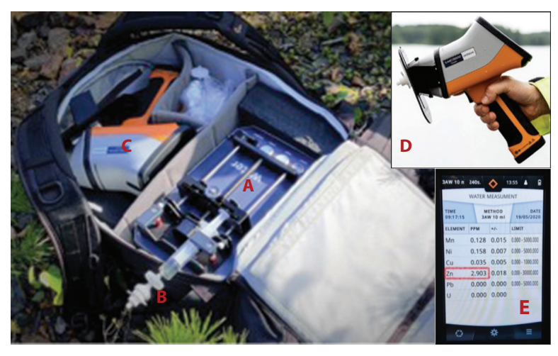
Figure 1 The 3AWater Multimetal Water Analysis System (MWAS, prototype 2.1): A) Battery operated syringe pump, B) consumable filters including a 0.45 µm prefilter and the metal collecting filter inside a filter holder, C) handheld XRF spectrometer, D) adapter on the spectrometer with the filter holder inserted and E) image of the screen of the spectrometer showing results from an on-site analysis (not specific to the present pilots).

The MWAS system was calibrated for four metals Mn, Ni, Cu and Zn. Empirical calibrations were made with water samples prepared by spiking lake water with known amounts of metals. The metal concentrations of the calibration samples varied between 50 \mu g L<sup>-1</sup> and 10 mg L<sup>-1</sup> and the pH was adjusted to 7. 10 mL of the water sample was pumped through the metal collecting filter with flow