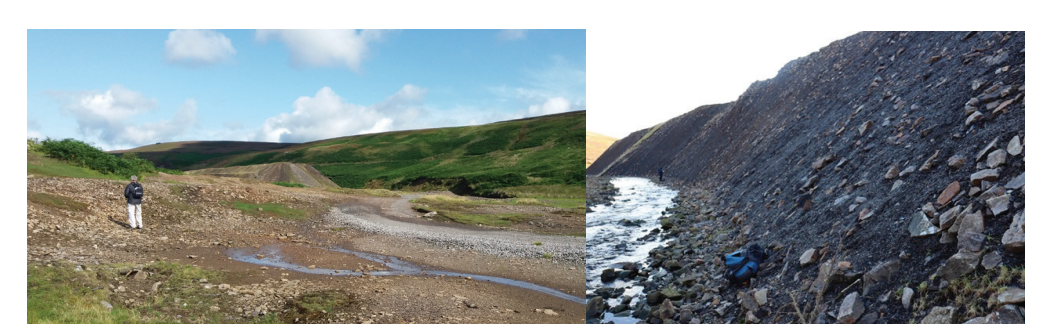
Figure 1 a Left: areas of investigation, looking north with drainage crossing the dressing floor in foreground and vegetation free driving spoil bund mid-distance. b Right: field sampling of the stream side of the driving spoil bund. Note range in grain size and seepage.

Geotechnical (pertaining to the geological, geophysical and hydrological) characterisation of the mine waste is fundamental for generating model input parameters as required for assessment of firstly the mine waste slope stability assessment and secondly the fines or tailings erodibility. Typical of abandoned mine sites, Great Eggleshope is remote with difficult access for sampling and in-situ testing demanding portable and rapid techniques. A further challenge is that mine waste properties stretch conventional geotechnical testing techniques. Firstly, because of the extreme range in grain size, particularly the distribution of cobble and boulder grade material, which undermines the value of in-situ probing techniques. Secondly the volume and heterogeneity of the waste, from which it can be difficult to obtain truly representative samples. Mine waste differs to naturally occurring soils (engineering definition) in that it is commonly angular and platy, which affects geotechnical properties, requiring the consideration in laboratory-scale testing. We