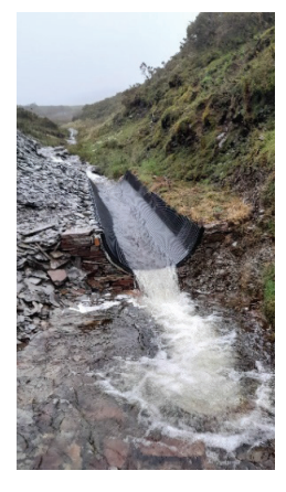
Plate 4 Nant Bwlchgwyn replacement 6m x 900mm halfpipe (NRW 2020)