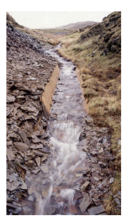
Plate 1 Nant Bwlchgwyn 1994 halfpipe (Mason 2011)

The collapse around Lee's Shaft was large in 2018, but by September 2020 a further collapse into the stope of approximately 4 m occurred. The failure was likely related to water migration at the base of the weathered zone, with visible seepages seen at rockhead flowing to the void following the collapse. Six piezometers were installed, four on the embankment and two north of Lee's Shaft in clusters of two, which confirmed variable groundwater levels. Geophysical methods to identify preferential seepages along the embankment are being considered to appreciate if an intervention such as cut off